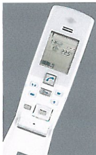
Handset with hinged cover open