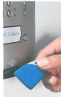
Anti-vandal keypad call point with prox badge