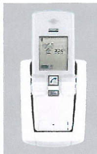
Handset with mains powered recharging base