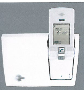
Handset with battery powered recharging base